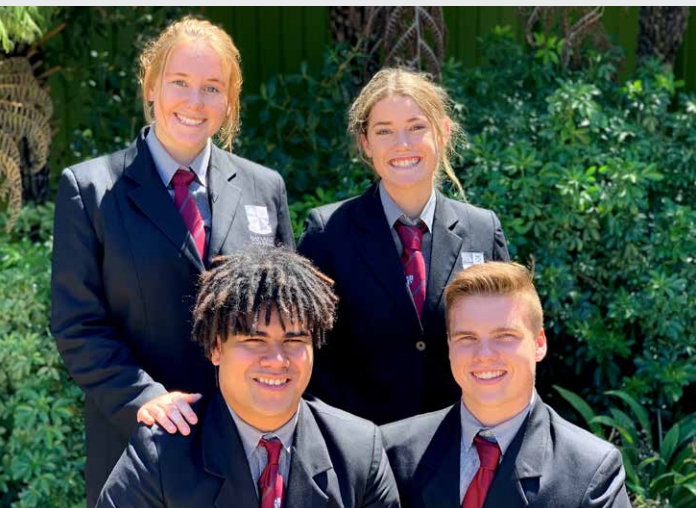
Student Leaders 2019